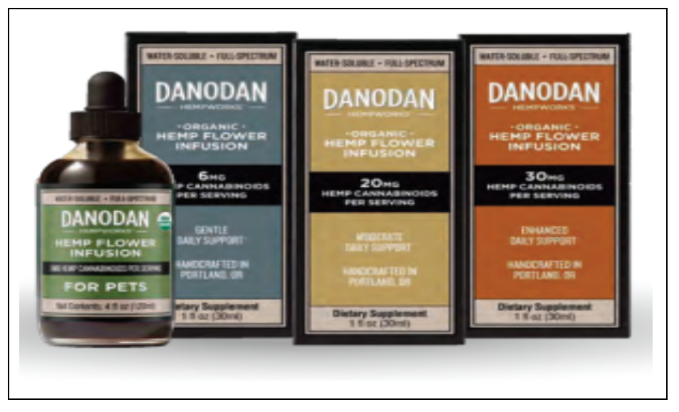
Figure 3: Danodan Hempworks